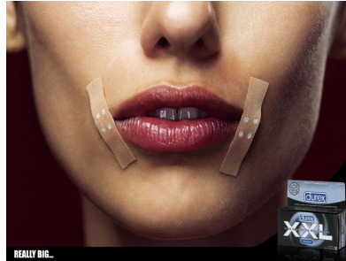
Advertisement 2: Durex XXL