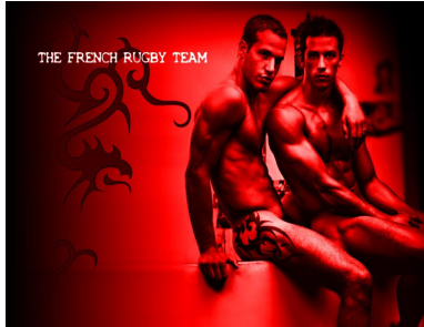
Advertisement 1: The French Rugby Team