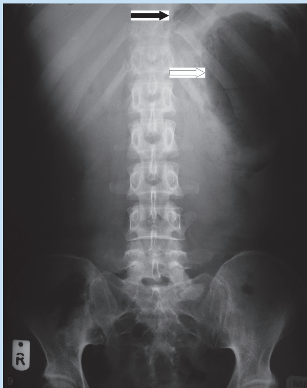
Fig. 2. Abdominal X-Ray, showing the displaced stomach bubble (black arrow). Laterally, a large ovoid gas shadow is seen (white arrow).