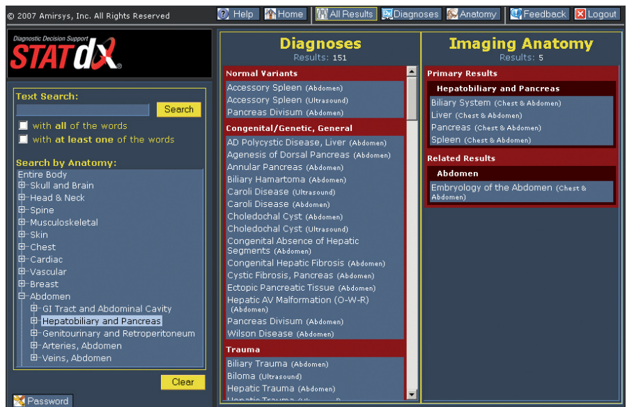
Fig. 3. Search results by category and relevance for the Hepatobiliary and Pancreas anatomical search.