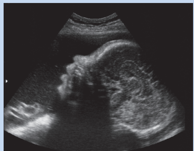
Fig. 2. Prenatal ultrasound of the head with lack of shadowing from the unossified skull shows better than normal visualisation of the brain due to unmineralised cranium.

Permission was not given for an internal examination on the post-mortem. X-rays revealed abnormalities thought to be consistent with OI type II.A Chromosome studies revealed a normal male karyotype, 46,XY. Collagen studies from the fibroblasts did not reveal any abnor-