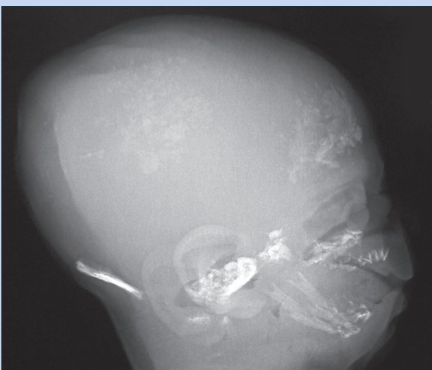
Fig. 4. Postnatal lateral view of the skull demonstrating diffuse lack of ossification and patchy island-like areas of ossification of the occipital bone, skull base, and to a lesser extent in the frontal and parietal bones.

but there may be 'island-like' areas of ossification as seen in our case. 5 In some cases there are osteochondral projections at right angles to the mid-diaphysis of the long bones of the arms and legs which are called Bowder spurs 1,3,5 and may be more specific for hypophosphatasia. Our case did not have Bowder spurs present however we did find sonolucent and radiolucent bones of the hands in keeping with the diagnosis of hypophosphatasia (Figs 5a and b, and Fig. 6).