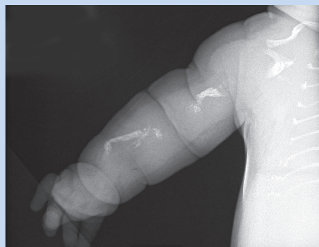
Fig. 6. Postnatal view of the arm with abnormal ossification of the short bones with multiple fractures present.

Differentiating these cases from OI type II can be difficult based on imaging because of the variability of findings and the overlap of the lack of ossification, multiple fractures, etc. Some of the radiographic features seen in our case direct us to favour hypophosphatasia, which was