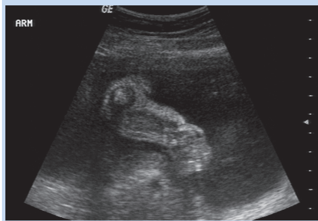
Figs 5a and b. Prenatal ultrasound of the arm demonstrating short angulated bones in keeping with multiple fractures.

but there may be 'island-like' areas of ossification as seen in our case. 5 In some cases there are osteochondral projections at right angles to the mid-diaphysis of the long bones of the arms and legs which are called Bowder spurs 1,3,5 and may be more specific for hypophosphatasia. Our case did not have Bowder spurs present however we did find sonolucent and radiolucent bones of the hands in keeping with the diagnosis of hypophosphatasia (Figs 5a and b, and Fig. 6).