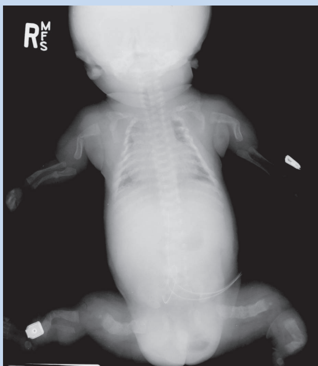
Fig. 1. AP view of a different child with the lethal form of osteogenesis imperfecta. Note the diffuse osteopenia and multiple fractures.

A male infant was delivered at term by vaginal delivery weighing 3.4 kg. Compassionate care was provided and the infant succumbed within several minutes. Other growth parameters included a crown to heel length of 47 cm and a head circumference of 34 cm. All limbs were visibly short, thickened, curved and measured much less than two standard deviations below the mean for gestational age. The chest appeared narrowed and the abdomen was protuberant. There were no other visible anomalies. The following investigations were requested: DNA banking for future studies, karyotype analysis, skin biopsy for collagen studies, skeletal X-ray survey, clinical photographs and a full autopsy examination.