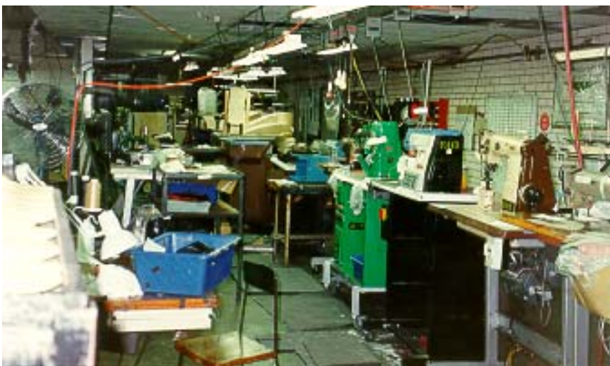
Figure 2. A typical small manufacturing industry.

Physical inspection showed most of the small manufacturing industries were housed in unsuitable premises. Workplaces were poorly designed. Ergonomic guidelines have seldom been followed and no data such as anthropometric data for ergonomic design of the workplaces were available. There was inadequate working space, and workplaces were assessed as having poor workplace layout and not organized although 41% companies showed having considered postural flexibility. Obstructions and crowding of equipment and materials were common in the seven companies studied in the physical inspection. Although 59% companies reported that they provide