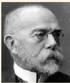
Robert Koch (1843–1910) 1

Seldom has an investigator been able to comprehend in advance with such clear-sightedness a new, unbroken field of investigation, and seldom has someone succeeded in working on it with the brilliance and success with which Robert Koch has done. Seldom have so many discoveries of such decisive significance to humanity stemmed from the activity of a single man, as is the case with him. 1