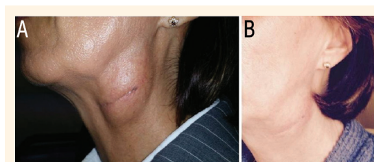
Figure 1: Photographs of a 54-year-old woman with a left branchial cyst which had (A) recurred following surgery but (B) resolved following OK-432 treatment.

A two-year-old male child presented in 2012 with a three-month history of a cyst in the left upper neck, measuring 5.2 x 3.5 cm [Figure 2]. The patient underwent nine sessions of OK-432 sclerotherapy, with no complications, resulting in complete resolution of the lesion. The patient was followed up for four years with no evidence of recurrence.