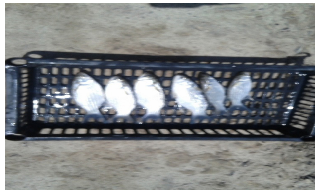
Figure 4. Mullet