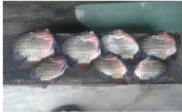
Figure 2. Guinean Tilapia

Table size fresh samples of the three fish species were taken from the river (Figures 2,3,4). After cleaning, they were wrapped in an aluminum foil and then put into ice. Finally, they were put in a black polyethylene bag and then all in a cooler to the laboratory for analyses.