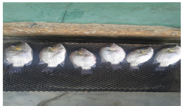
Figure 3. Blackchin Tilapia