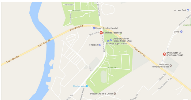
Figure 1. Location of Choba river

The arrow in Figure 1 shows the sampling site. This river is located between longitude 6°53.95E and latitude 4°53.78N [16] . It is in Choba village. Close to it is an extension of Wilbros Nigeria Limited (WNL), an oil Servicing Company.