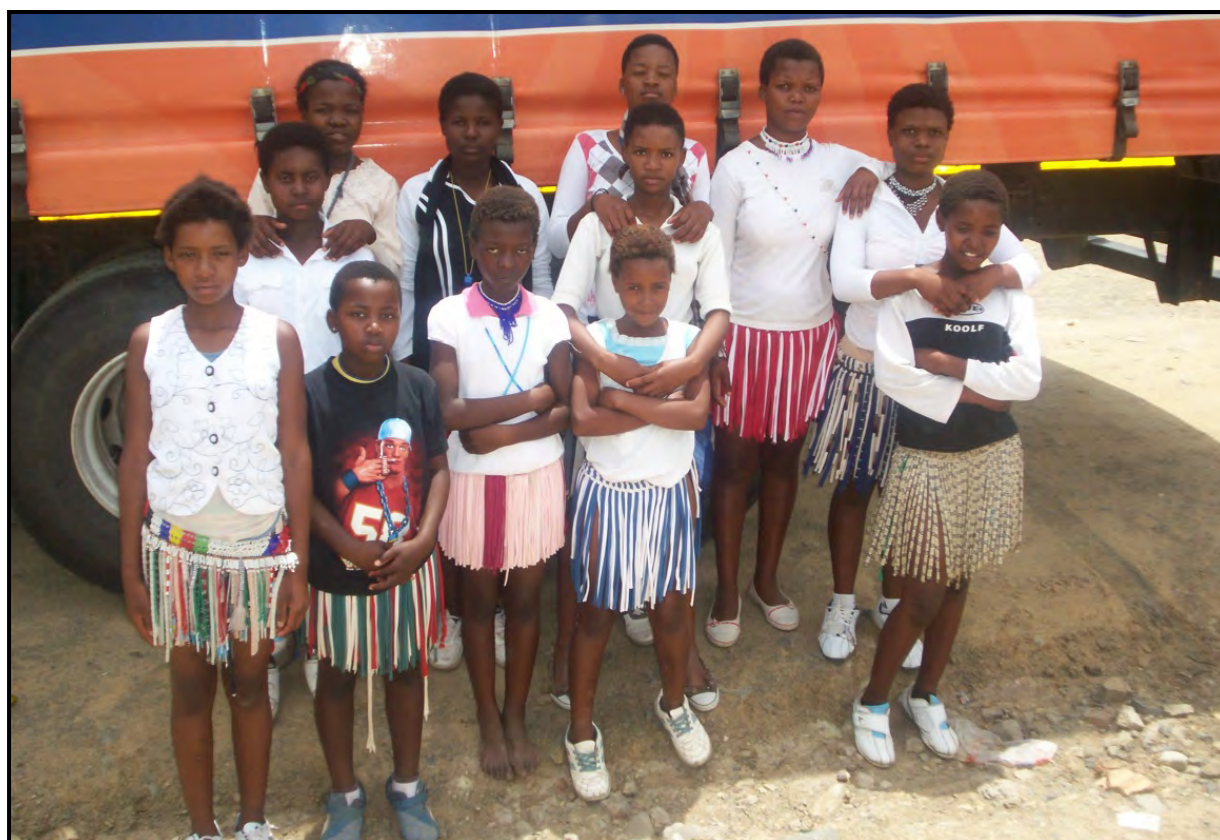
Figure 2: Mamtiseni initiates display their attire

From the early days the attire worn by the initiates when performing dances for both initiation ceremonies has been ibheshu . 5 However, the type of ibheshu used for initiation ceremonies currently is made from synthetic materials and cloth. The colours of the skirts vary depending upon the taste of the initiating midwives. However, from the videos we analysed it was evident that despite the skirts being made from cloth and other synthetic materials, the colour was that of animal skin print. Platjies (2013) points out that the size of the small skirt signifies the girl's state of being intombi-nto (being pure or being a virgin). Initially the initiates performed with bare chests, but as a result of increased accusations of 'public indecency' from Christian organisations, the girls wear T-shirts or beads. The initiates no longer go barefoot, but wear canvas shoes, especially when performing dances in public. The picture illustrates the change in the type of attire worn during initiation.