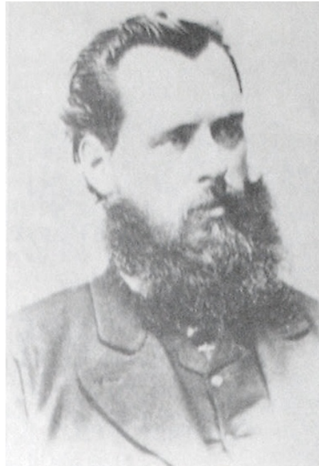
Figure 6. Avon Bruce-Brand 45

James Tennant was born in 1839. He served in the British army engineering corps during the Sepoy mutiny in India in 1857–1859 and later in China. During the 1860s he was resident in the Cape Colony. Tennant went back to England to make a contribution in the construction of the Thames fortifications and then went to Ireland before returning to Cape Town in 1875. He was appointed as city engineer of Cape Town, a position he held from 1876 to 1880. In 1880 he was granted leave to take part in the Basotho War and during the war he resigned from his post as city engineer. Tennant later worked in Cape Town as a private engineer, surveyor and architect.