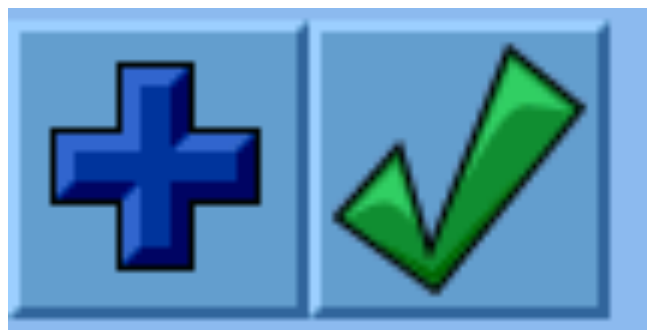
Figure 1 Buttons for selecting and adding objects

We saw evidence of this in both the educational games, where there were clear usability problems. For example, in Timez Attack , a congratulatory message incorrectly appears on the screen before the player had actually achieved any milestone in the game. All the children ignored the message. The adults were taken aback or questioned why they were being congratulated before completing a task. In Storybook Weaver the buttons for selecting and adding objects to a story page do not follow general interface conventions. Children, however, were unperturbed when they had to select and add an object by clicking on the + button instead of the expected ✓ button, as shown in Figure 1 below.