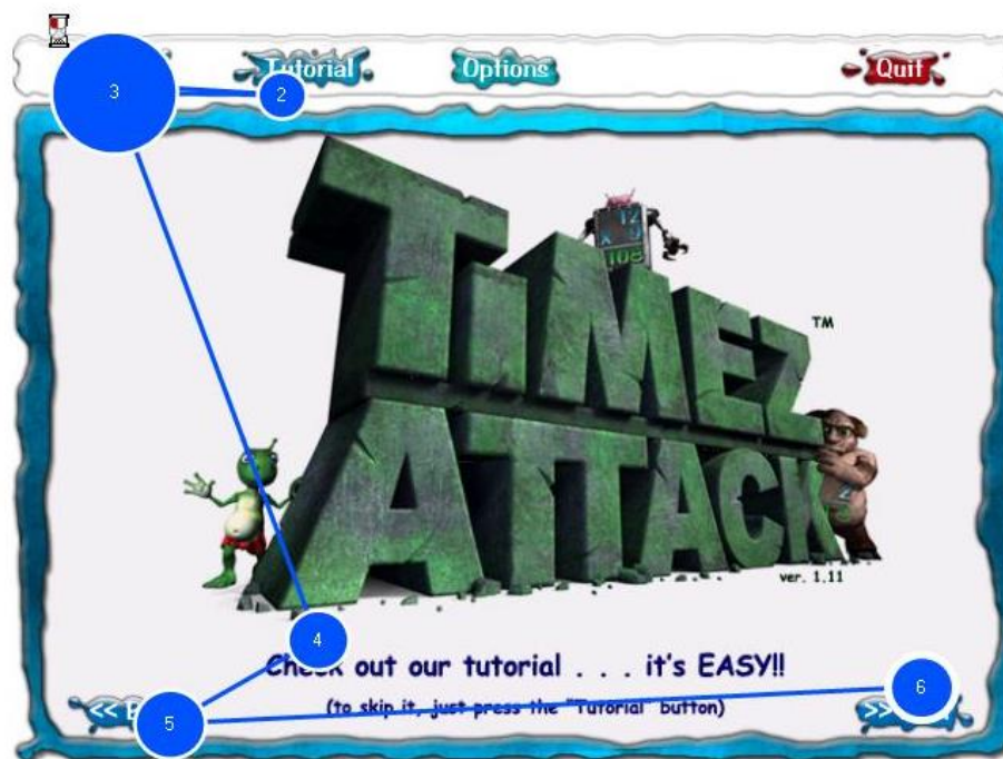
Figure 2 Fixations of a child novice on the opening screen

Children displayed fearlessness when confronted with a new application. They just wanted to get on with it, while most adults first consulted the instructions or tutorials. Eye tracking results revealed that when the application was a game, children immediately searched for the button that would activate the game. In Timez Attack , for example, the longest fixations of child novices were on the Play button at top left on the screen (see Figure 2). Adult participants, by contrast, fixated on the instructions at the bottom of the screen. This particular adult did not look at the Play top left button at all, as shown in Figure 3.