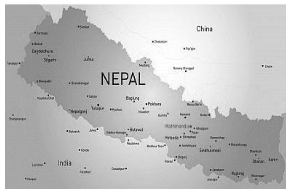
Map 2. Geolocation in Nepal

of South Asia. In this context, the paper addresses the political motivations behind Nepal to welcome BRI and significantly how it could reshape bilateral relations between Nepal and India while testing how Chinese presence in South Asian regional security complex will reinforce or reiterate the major security concerns.