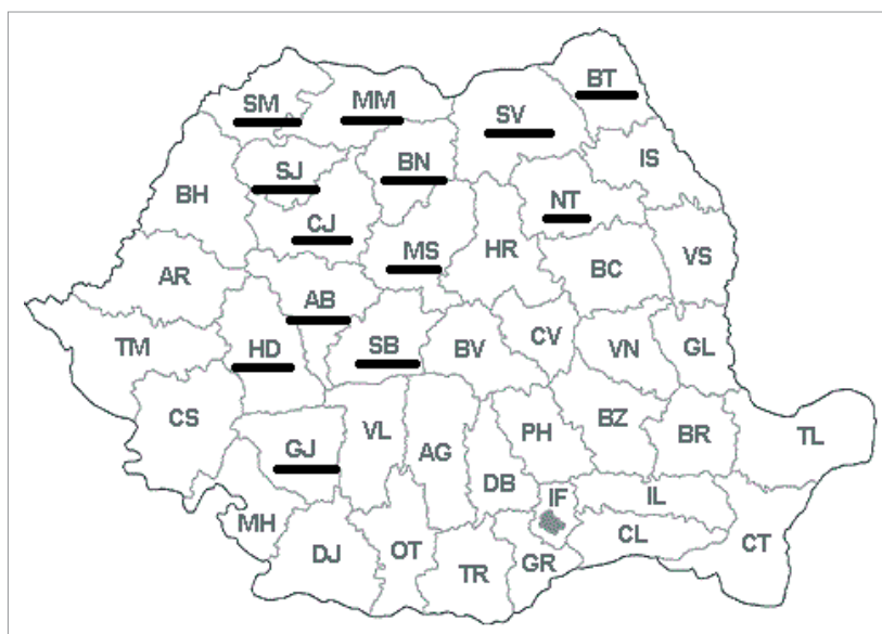
Figure 1: Romanian counties included in the research study

Data from Table 1 (see the Appendix) present the communes included in the study by development region and by county. The North-West development region was the best represented region, by including 5 counties (BN – Bistrița-Năsăud, CJ – Cluj, MM – Maramureș, SM – Satu Mare, SJ – Sălaj) and 28 communes, most of them from Cluj and Sălaj counties (16, and 5, respectively). The North-East and Center development regions included 3 counties each (BT – Botoșani, NT – Neamț, SV – Suceava, and AB – Alba, MS – Mureș, SB – Sibiu, respectively), and a total of 10 communes. The West and South-West development regions included one county each (HD – Hunedoara and GJ – Gorj, respectively), with 3 communes. Altogether, a total of 42 communes were included in the research study. In one of the communes from Cluj county, two social workers were interviewed. Figure 1 shows the distribution of the 13 counties included in the research study on the map of Romania.