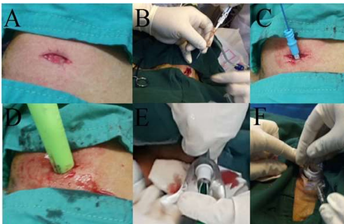
Figure 1. Stages of percutaneous dilatational tracheostomy A:Incision; B: Insertion of guidwire; C: insertion of small dilator; D: preparation of dilator; E: tracheostomy replacement; F: tracheostomy fixation

Complications related to PDT, such as serious complication (cardiopulmonary arrest, trachoesophageal fistula, intermediate complications and posterior tracheal wall perforation) and minor complication (bleeding, tube misplacement and emphysema) were documented.