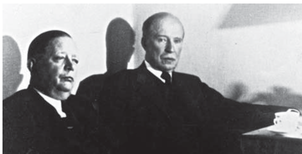
Figure 2. Ernst Kretschmer and Henrik Sjöbring on Sjöbring's sofa.