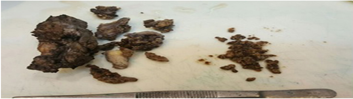
Figure 2. Extra renal stones excised.

Five years later, he came with pain and discomfort at right lower quadrant around the graft. Examination revealed subcutaneous tense and immobile mass. Patient serum creatinine was 1.7 mg/dl without any urinary problem. We accomplished biopsy which reported inflammation and fibrosis with calcification. Computed tomography (CT) marked large calcified mass ventral to graft but sparing the graft and spreading to pelvic cavity. ( Figure 1 )