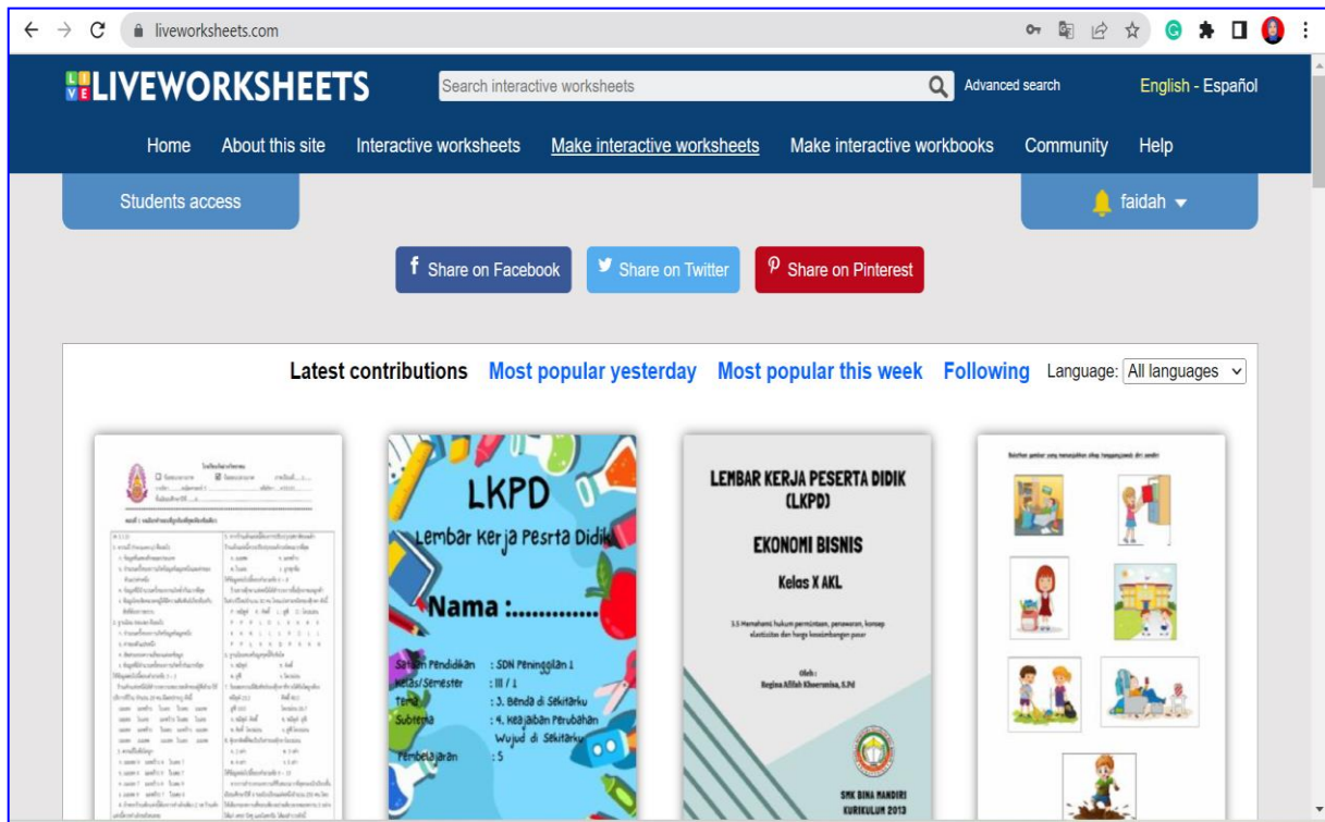
Figure 1. liveworksheets

Several instructions for implementing the “liveworksheet” and its modifications are outlined. These exercises are meant to allow students to observe and practice their listening skills (Rukthong & Brunfaut, 2020). Following these steps is all that is required to use a worksheet effectively: 1) Visit the official website for the live worksheet at https://www.liveworksheet.com/ . 2) There is a "Teacher Access" menu in the upper right corner; click the menu, then click "Register." 3) Fill out the relevant information, then click "Register" once the information has been entered correctly. 4) Click the activation link contained in the email issued by the live worksheet after registration. 5) Please then return to the website and complete the first and second ways. In the second method, however, you are not required to click "Register." The only required fields are "Password" and "Email." 6) Then click "Enter". 7) Language can be changed through the language options. 8) In the "Interactive" menu, you can ask or change questions. 9) Click "Make Interactive Worksheet" afterward. 10) Then, click "Get Started".