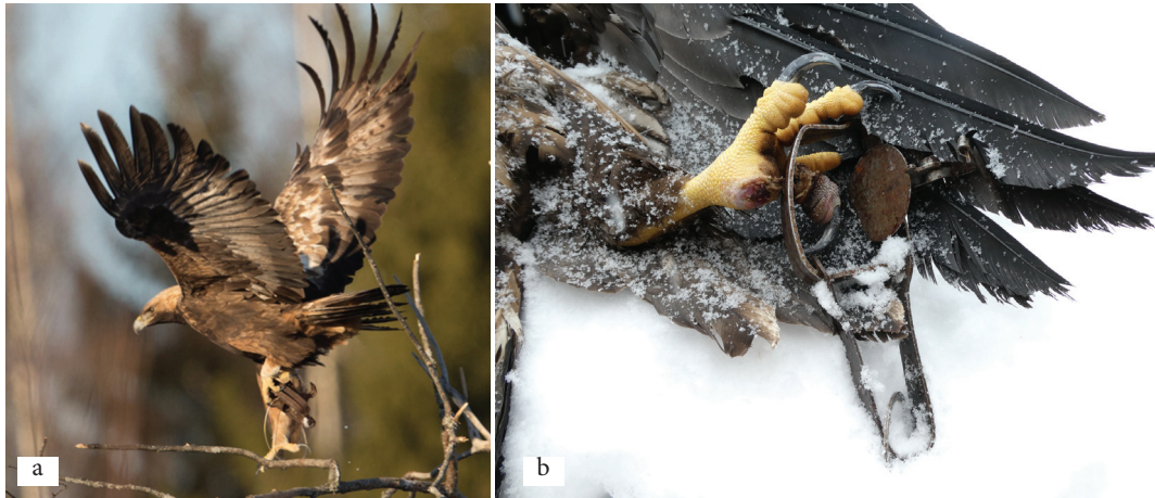
Fig. 3. The Golden (a) and White-tailed (b) Eagles suffered from traps set by hunters at Carrion to Catch Wolves, Red Foxes, Raccoon Dogs and Pine Martens.