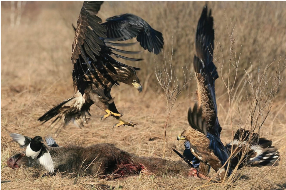
Fig. 2. The Golden and White-tailed Eagles feed regularly on carrion and physical interference takes place quite often.

*Diets of the predators are taken from Sidorovich et al., 2011