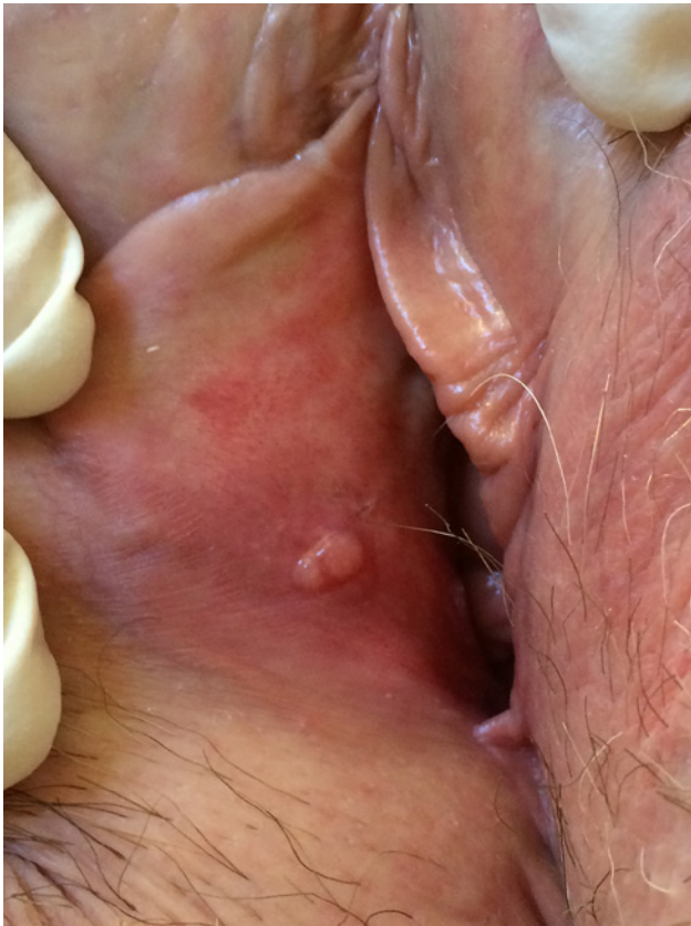
Figure 1. Clinical appearance of a non-pigmented lesion of the right labia.

referred to dermatology for closer examination. Clinically a whitish papule on the inside of her right labia minora was visible (Figure 1).