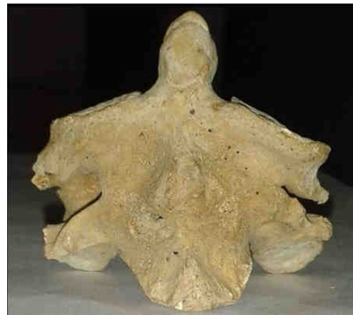
Figure 1 - Photograph showing complete fusion of body of C2 and C3 from anterior aspect

were 5.5 mm and 5.0 mm respectively while of C3 vertebra was 6.0 mm on right side and 6.5 mm on left side. The pedicles and transverse processes were not fused (Figure 3).