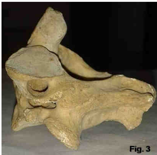
Figure 3 - Photograph showing non-fusion of pedicles and transverse processes of C2 and C3 in left lateral aspect